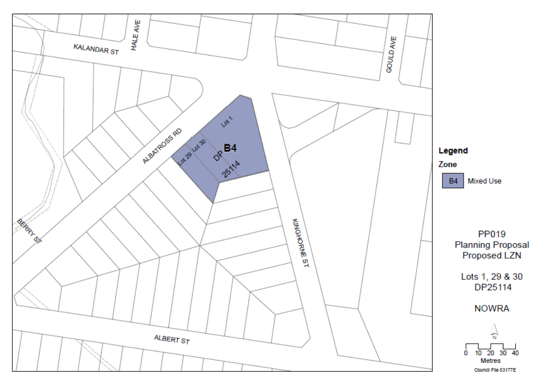
Figure 5: Proposed Zoning