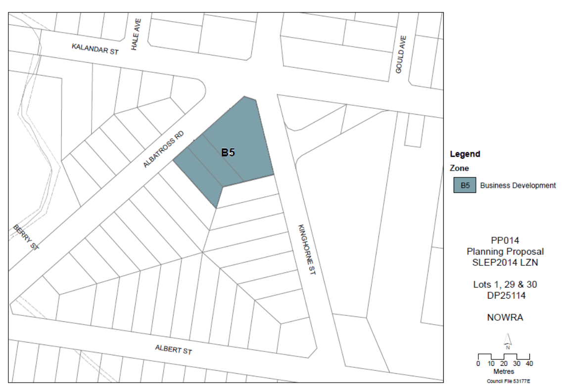
Figure 4: Current Shoalhaven LEP 2014 zoning