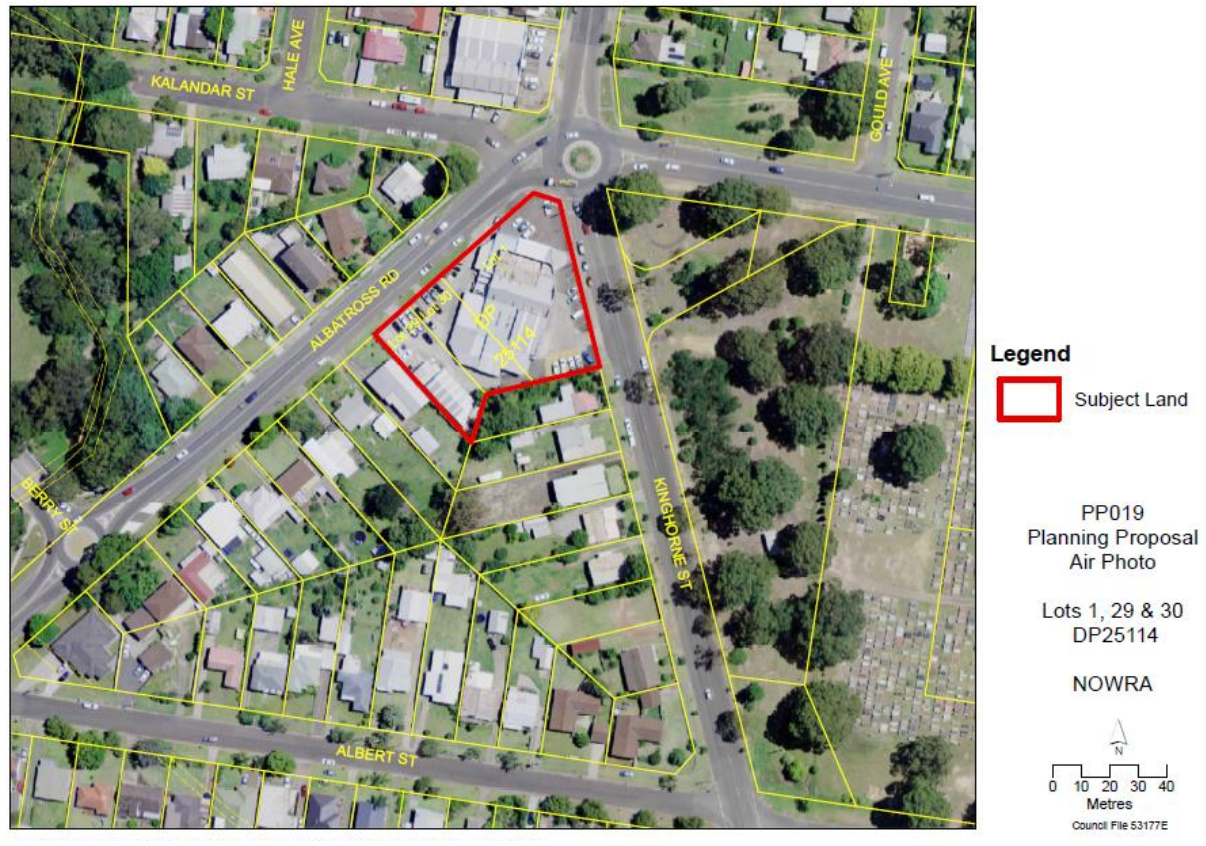
Figure 3: Aerial Photo